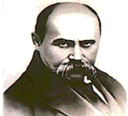
Taras Shevchenko (1814-1861)