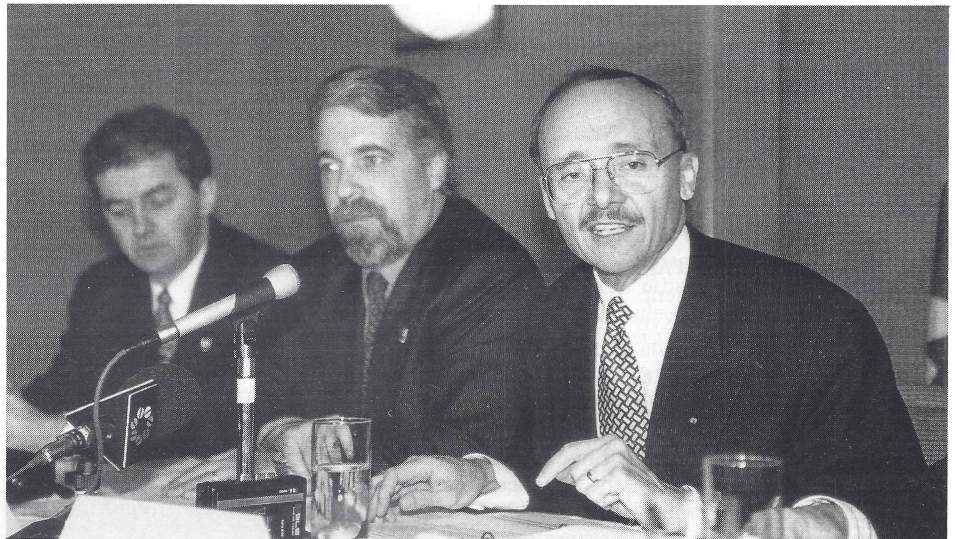
International Cooperation Minister Don Boudria (right) with Mtre. Denis Marsolais (centre) at Press Conference announcing notarial reform project. Minister Boudria is expected to make his first official visit to Central and Eastern Europe this Spring.

Notaries are public officers who attest or certify such written documents as deeds or wills to make them authentic; they also take affidavits and deposition. The notarial profession exists in over 80 countries, and in