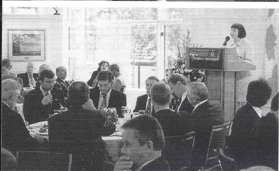
Some of the CUBI Sector sessions: Construction - Winnipeg (top), and Energy - Calgary (centre). Bottom: Among the speakers at the CUBI-IEC luncheon was Justice Minister Anne McLellan.