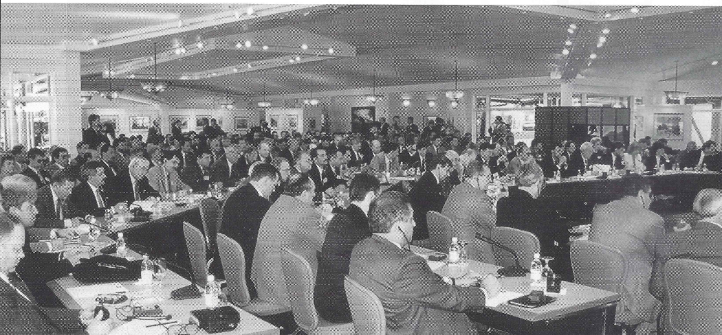
Some of the more than 300 participants of the 2 nd meeting of the Intergovernmental Economic Commission and the CUBI Canada-Ukraine Conference in Calgary.

and Gas Association, along the lines of the Canadian Petroleum Association, which would provide lobbying and marketing support in Ukraine.